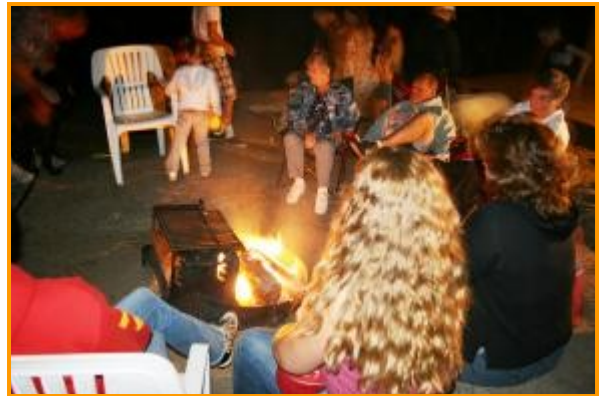
Friday night campfire