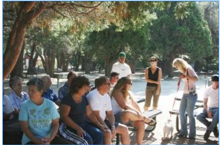
Gathering for Sunday Service