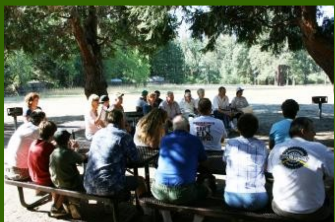
Gathering for Sunday Service