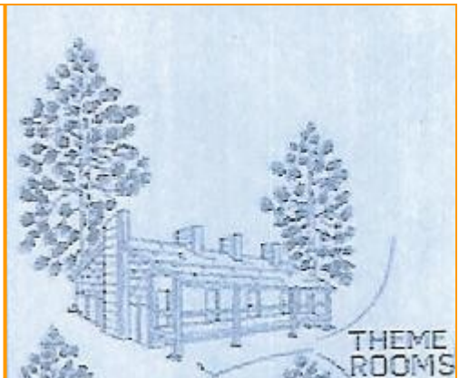
Fall Theme Room (second from the left)