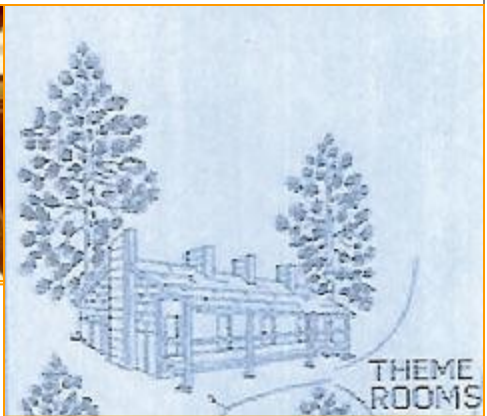
Summer Theme Room (far left)